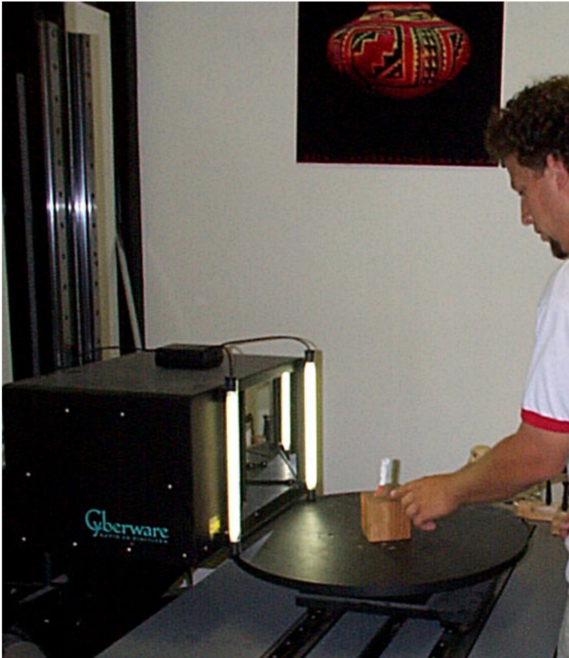
Figure 1: 3D scanner with artefact; a researcher indicates where the laser hits the object.